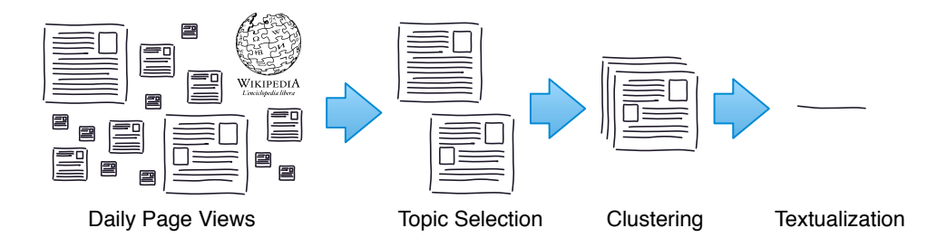
Figure 2: Process diagram: (a) Topic selection: select interesting articles based on increase in pageviews. (b) Clustering: cluster the articles according to relevant events using topic models or Wikipedia's hyperlink structure. (c) Textualization: select the sentence that best summarizes the relevant event.