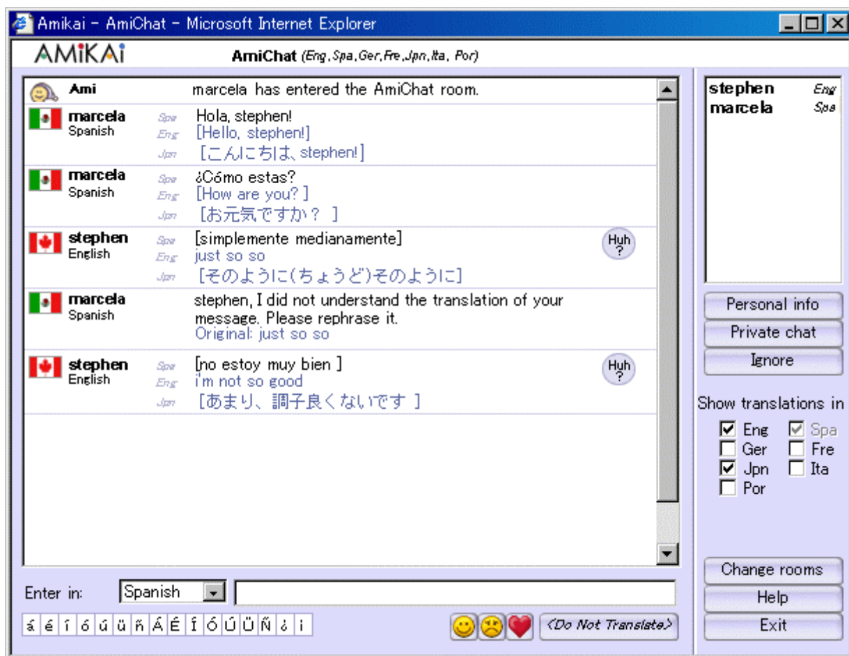
Figure 1: The “Huh?” button in AmiChat

Additional applications and new features for the existing applications are also being readied for release. As the applications are developed, we attempt to maximize their overall usefulness through user-focused design incorporating feedback cues.