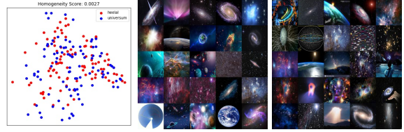
Figure 2: (left) PCA plot of image embeddings of the word universe in Afrikaans ( heelal ) and in Dutch ( universum ) showing their tightly overlapping image clusters, (center) images of heelal in Afrikaans, (right) images of universum in Dutch.

On the contrary, Korean to Japanese and Korean