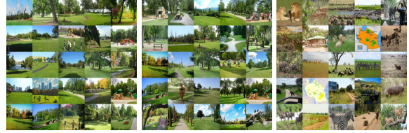
Figure 4: Images of the word park in (left) Afrikaans, (center) Dutch, (right) Swahili.

In this paper, we study when images may be useful for translating words between two languages from the perspective of their cultural and geographical relatedness. We observe that translatability of words via images vary in different language pairs, with language pairs sharing cultural similarities having better image translatability.