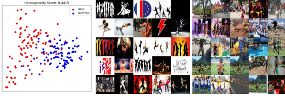
Figure 3: (left) PCA plot of image embeddings of the word dance in Afrikaans ( dans ) and in Swahili ( kucheza ) showing their tight but disjoint image clusters, (center) images of dans in Afrikaans, (right) images of kucheza in Swahili.

images express different meanings of the word. For example, the word dance : dans in Afrikaans and the word kucheza in Swahili have tight but disjoint image clusters (i.e., high homogeneity score) as can be seen in the PCA plot of their image embeddings and in the images (Figure 3), as kucheza means both to play and to dance in Swahili.