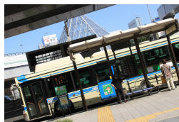
Figure 1: An image with the top five captions from standard beam search and from random sampling. Note the latter set is more diverse but lower quality.

A bus parked at a bus stop at a bus stop. There is a bus that is at the station. A man standing by a bus in a city. A bus pulling away from the train station. A bus stopped at a stop on the sunny day.