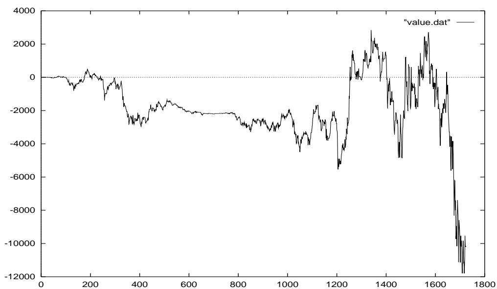
Figure 1: Profit and Loss of Client