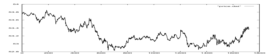
Figure 3: MSFT Share Price