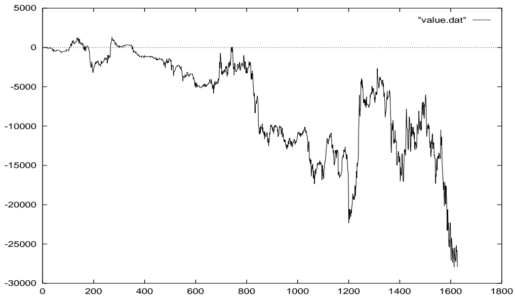
Figure 1: Profit and Loss of Client