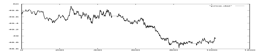
Figure 3: MSFT Share Price