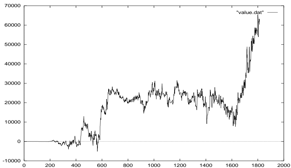
Figure 1: Profit and Loss of Client