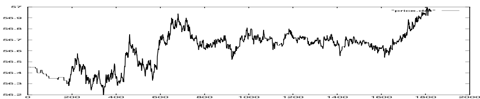
Figure 3: MSFT Share Price