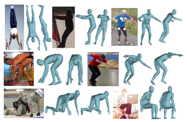
Figure 3. Successful 3D pose and shape predictions of our approach on challenging examples of UP-3D.

either from UP-3D (provided by Lassner et al. [22]), or from CMU MoCap (provided by Varol et al. [51]). The Human2D network remains the same in both cases.